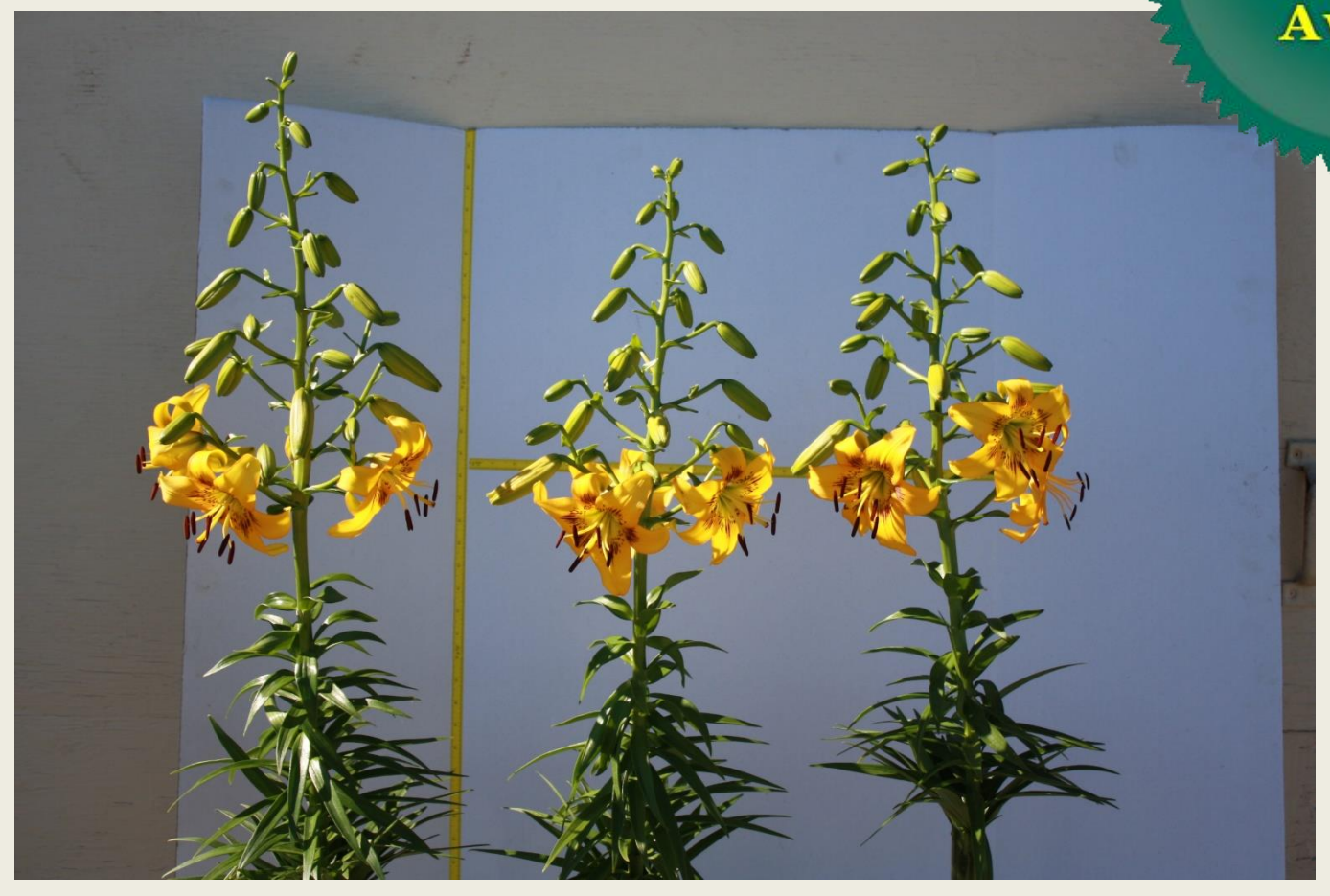
'Yellow Bruse' , exhibited by Brian Bergman Section: B, Class 23