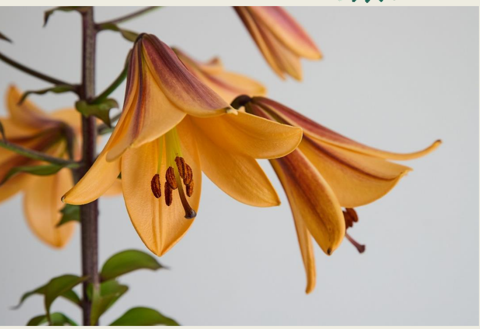
'Unnamed Apricot Trumpet' , exhibited by Thysje Arthur Section: E, Class 37