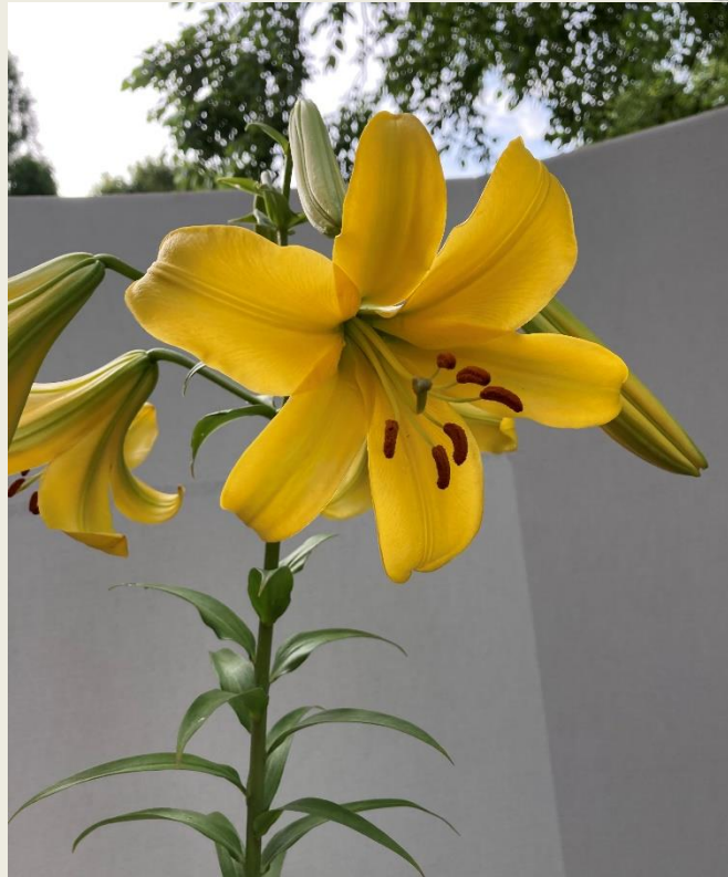
'Fitz Yellow Trumpet' , exhibited by Lynn Slackman Section: C, Class:29