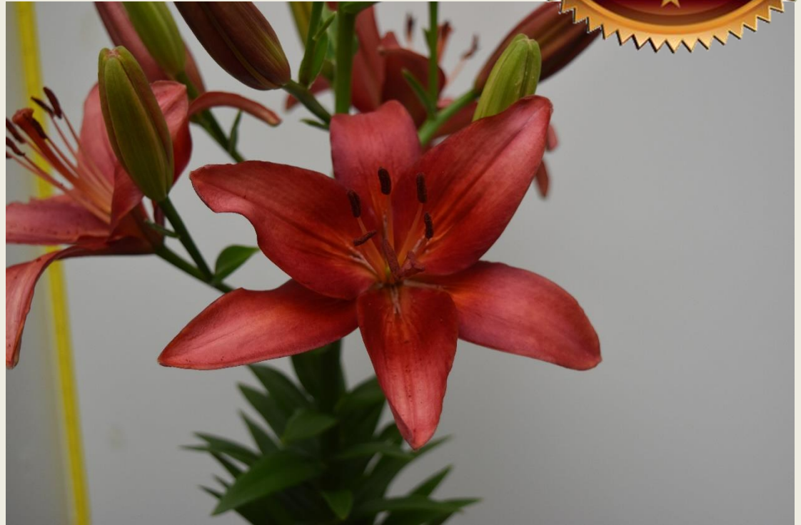
'Griesbach Seedling GW' , exhibited by Peggy Nerdahl Section: C, Class:24