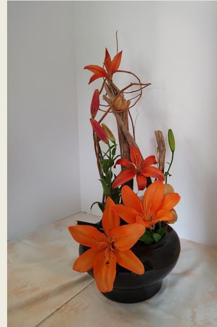
Entry 225 (N)